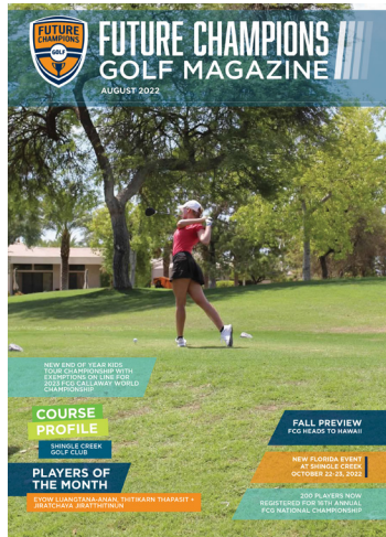
Monthly Junior Golf Magazine